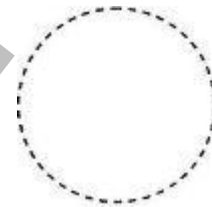
[Common seal of company]

_____ Signature Company Secretary/Director